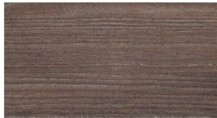
COD. 04 ROVERE GREY | GREY OAK