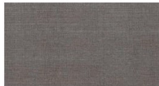
COD. 55 ANTRACITE | ANTHRACITE