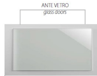
COD. 99 BIANCO SATINATO | SATINED WHITE