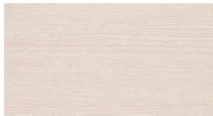
COD. 03 ROVERE | OAK