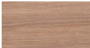
COD. 06 NOCE PAVIA | PAVIA WALNUT