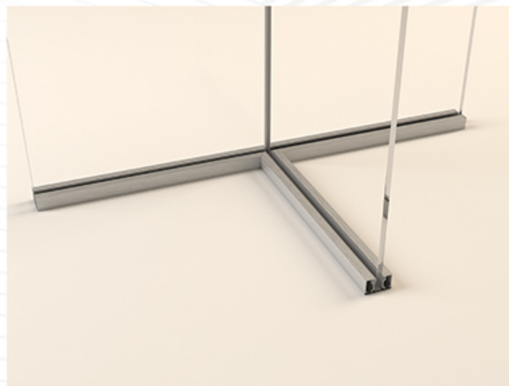
INTERESCTARE IN T INCROCIO A TRE VIE T INTERSECTION